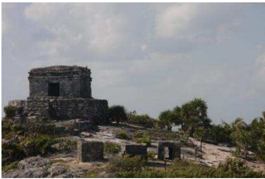
A closer view of one of the Mayan temples