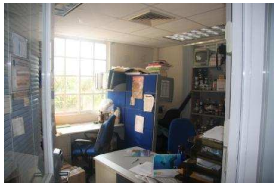
Our cubicle. My table is the one in front of the window. And, unbelievable but true, behind the separation wall there is Luis laboratory