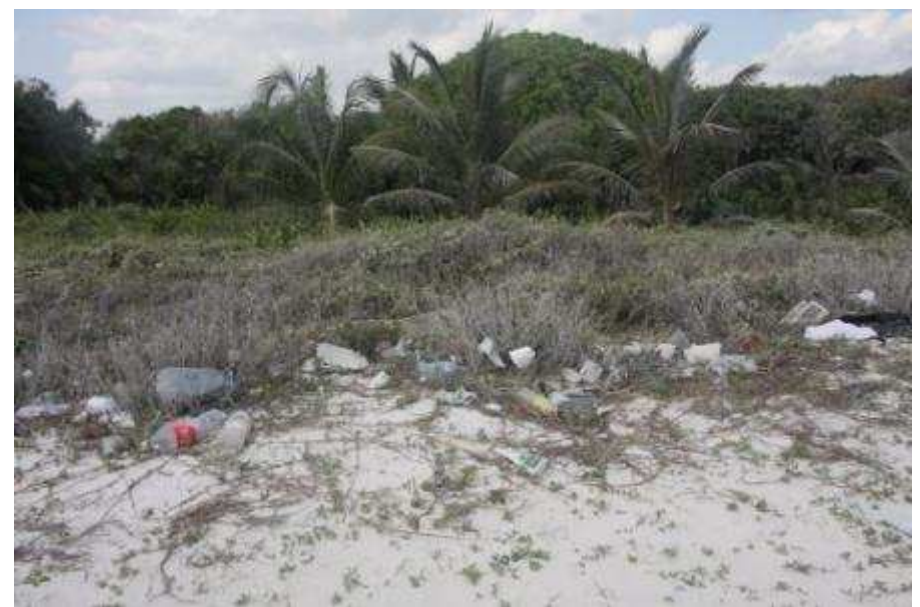
Waste management at the beach of Mahahual