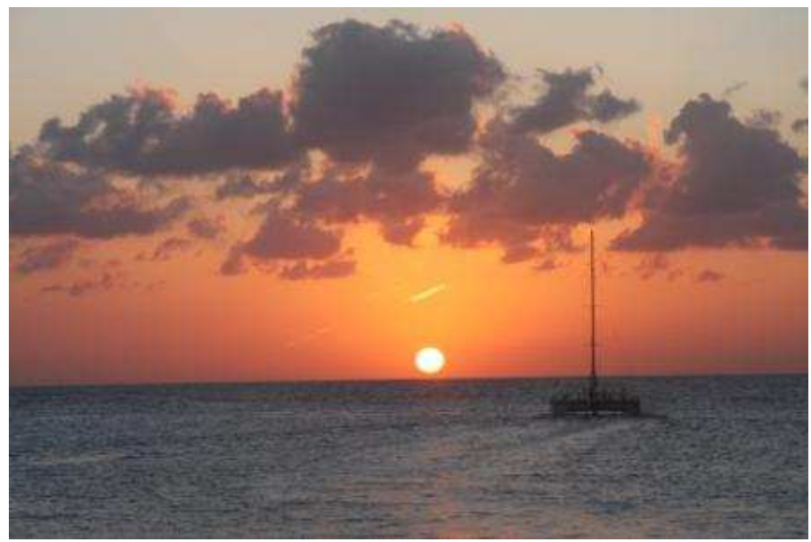
Looking back on the ferry ride from Playa del Carmen to Cozumel

I am actually really sorry that the quality of the pictures is pretty critical, but as I am having trouble uploading bigger sizes probably due to the internet connections...once I am back in Germany the images of high quality will be shown immediately!