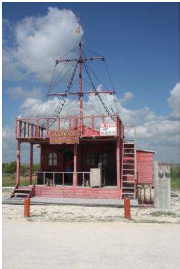
It's for sale...in Mahahual