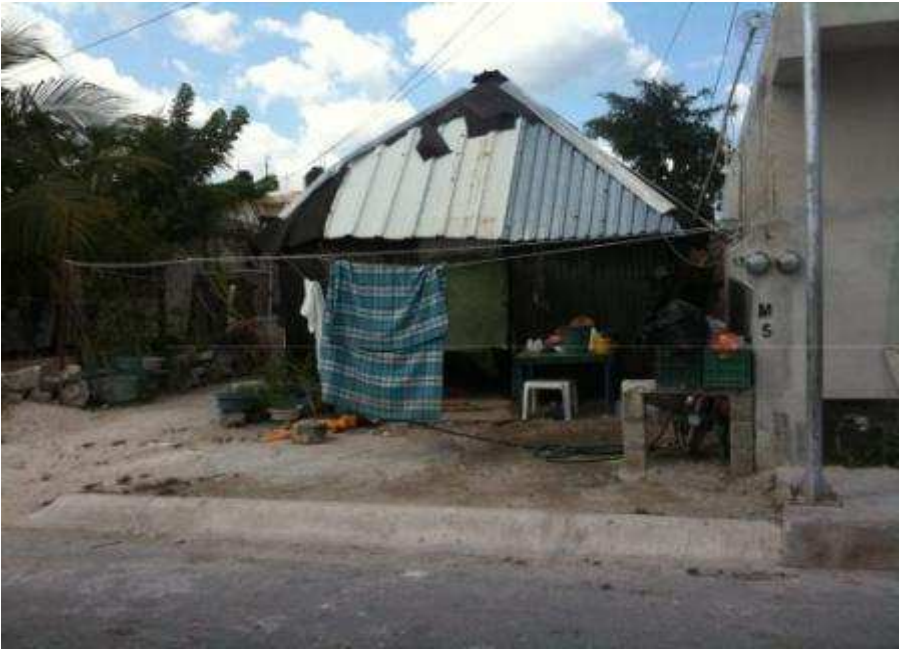
Also a typical house, but in San Miguel de Cozumel...