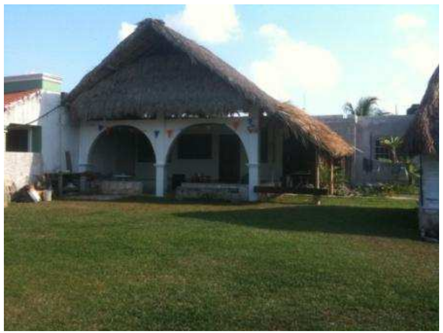
Nice houses with garden can be found here, they are mainly secondary residences for the ones that can afford it