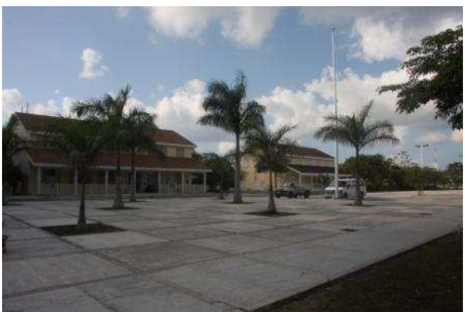
The university having the entrance area to the right hand side of the picture

Before leaving next Tuesday I will send you at least a quick goodbye!