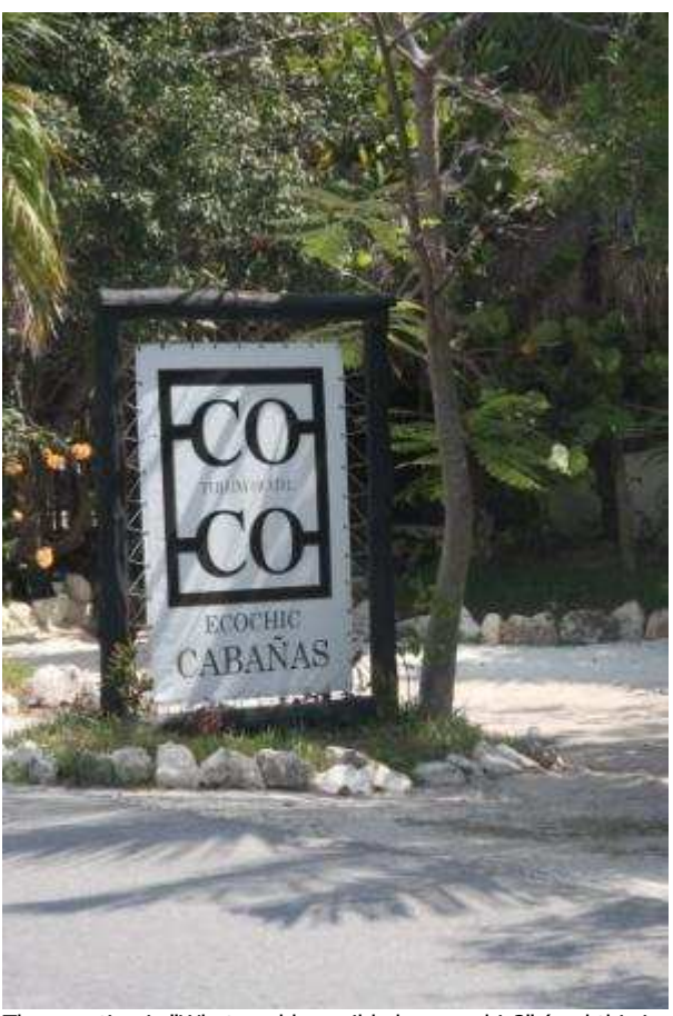
The question is "What could possibly be eco-chic?" (and this is not the only place in Tulum "using" eco)