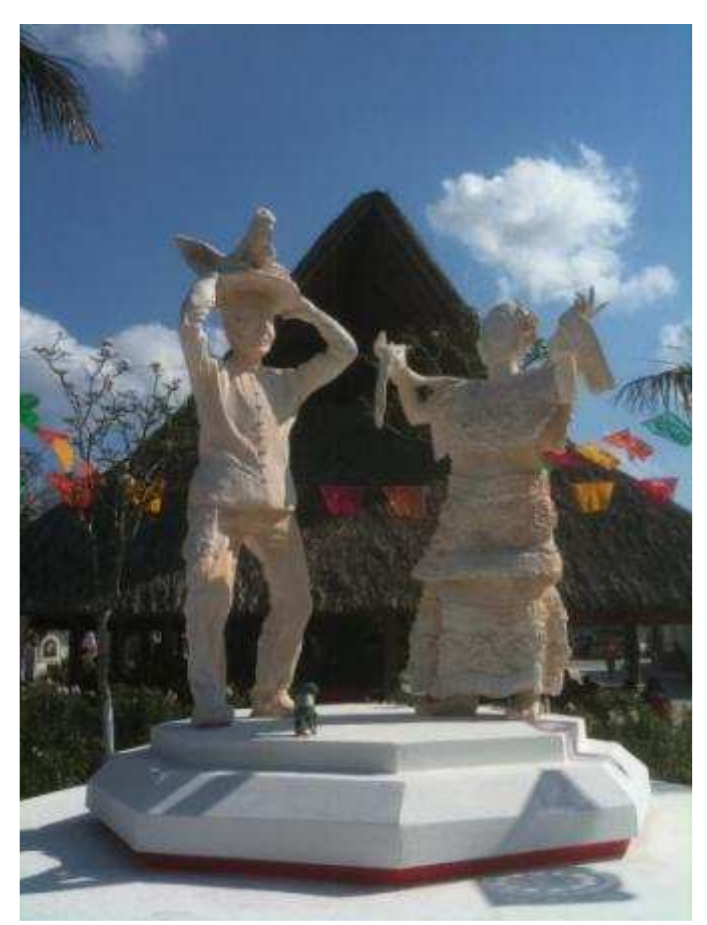
Statues at El Cedral doing the traditional dance of the festivity