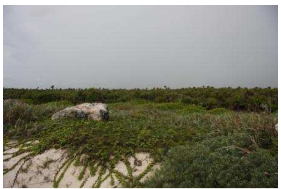
Cozumel's landscape outside of San Miguel