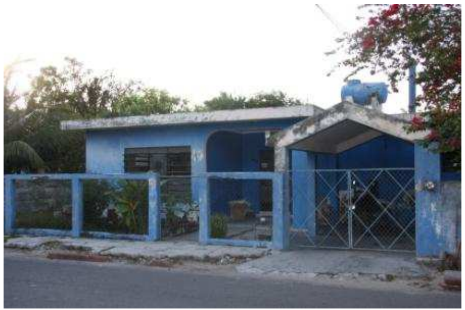
A home of the local community