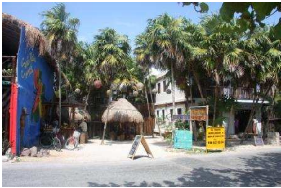
Right next to the one above