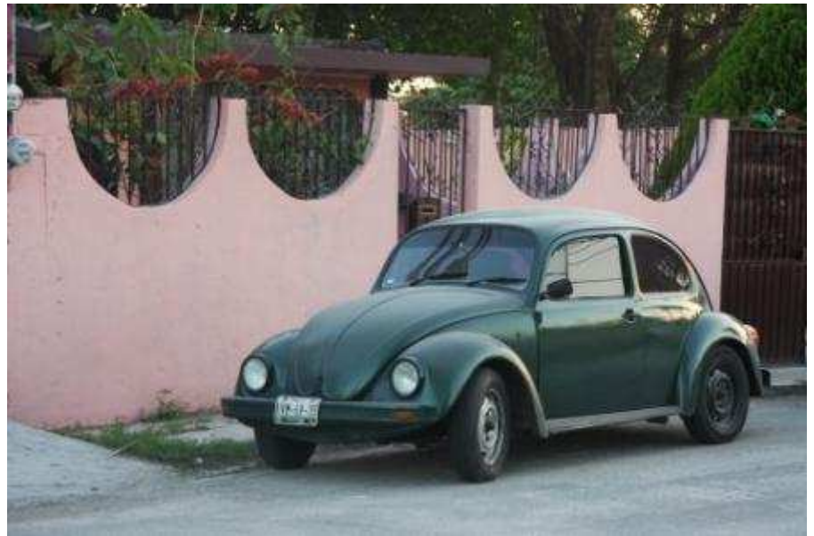
There are very many of them in Mexico