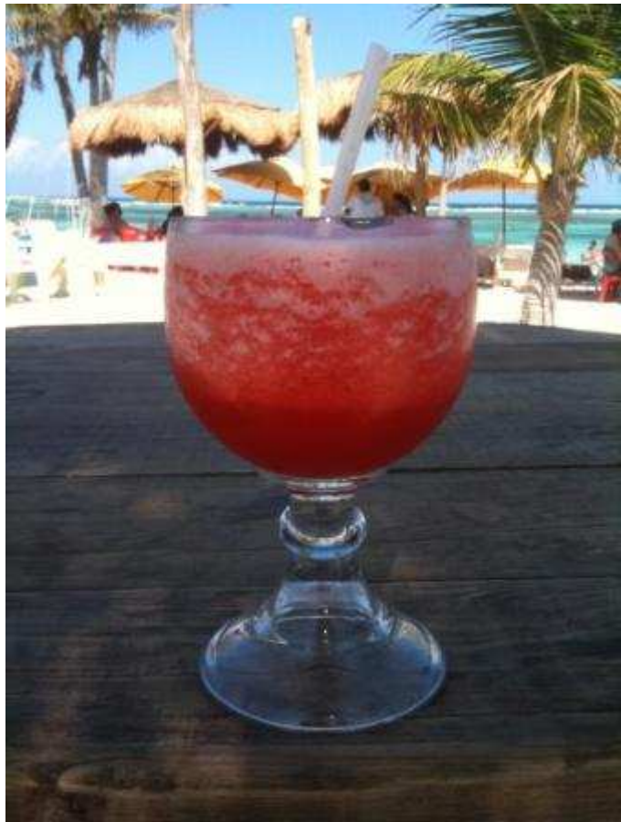
That is how a real Margarita looks