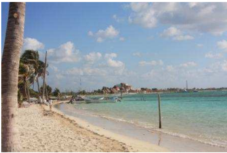
The beach in Mahahual, almost no construction near