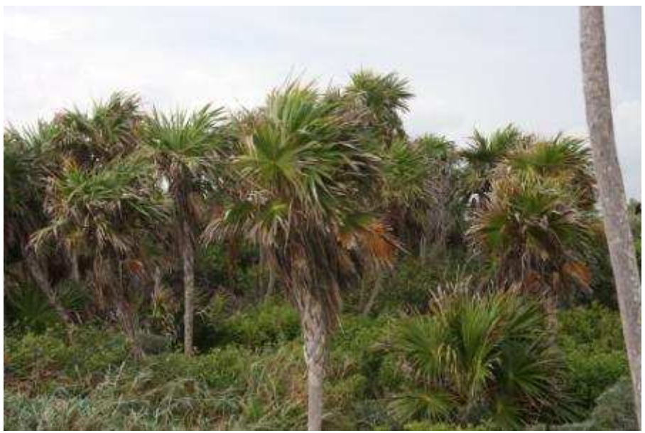
Medium heights plant cover, due to the hurricanes typical for the island