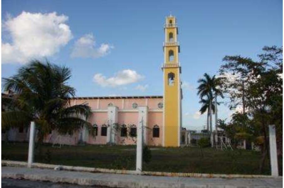
Church Corpus Christi in Cozumel