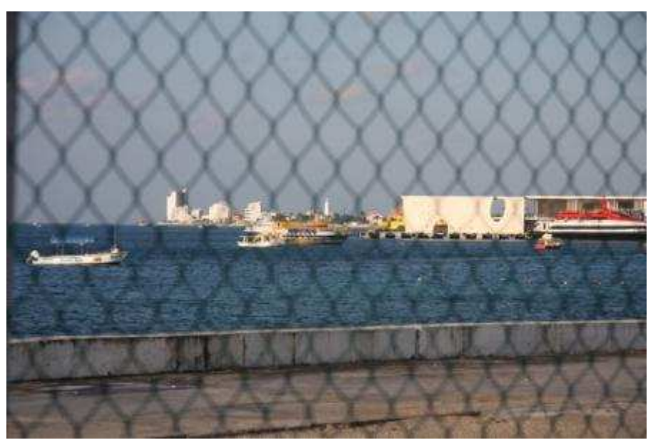
Ferry landing stage in Cozumel