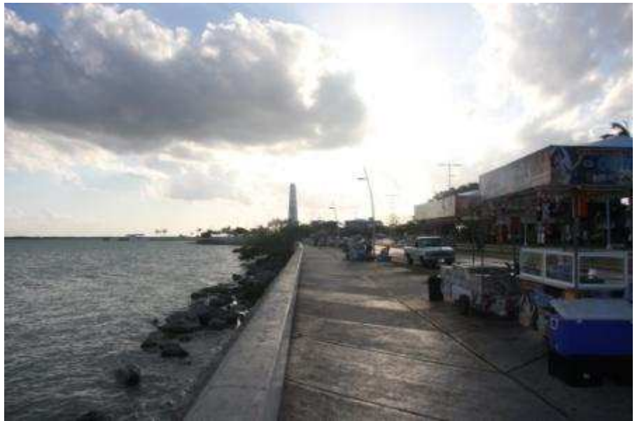
Typical driving snack bar and the malecón of Chetumal