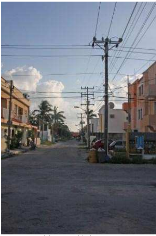
Street just around the corner of the house I am staying at