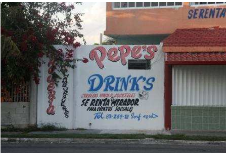
This is how you save paper (example from Chetumal)