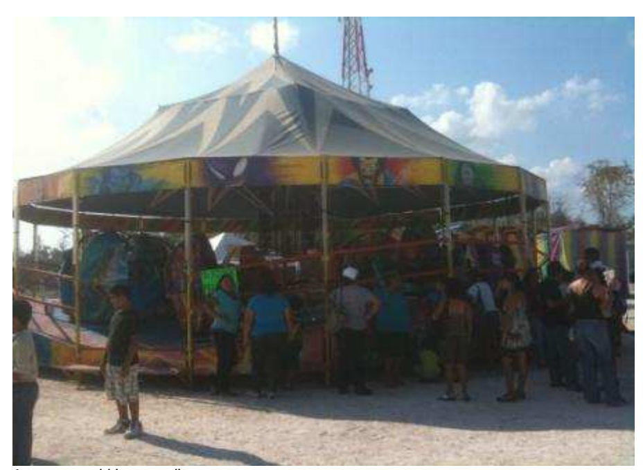
A very very old 'carrousel'