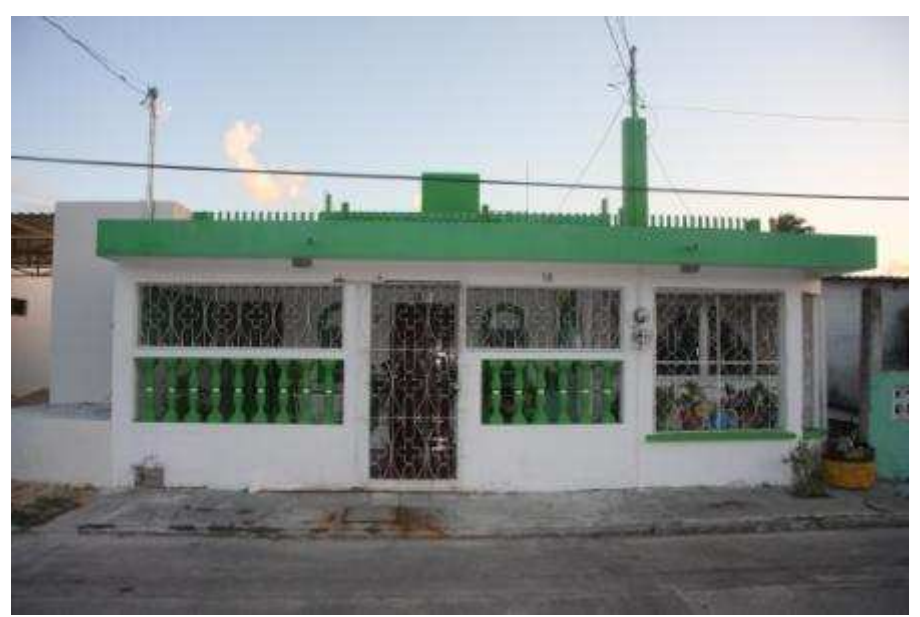
Another local home, this time in Chetumal