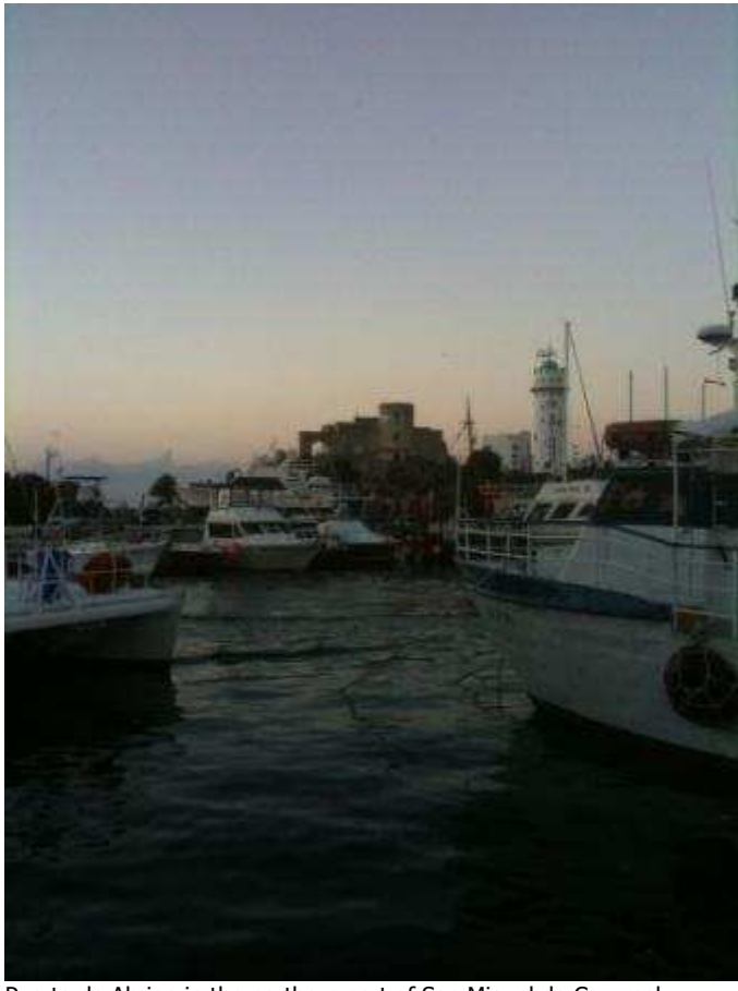
Puerto de Abrigo in the northern part of San Miguel de Cozumel

As promised I will give with this entry some more close-up information on Cozumel, provide pictures from my trip south and I also want to give an update on the work on my thesis.