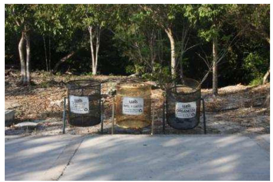
At the university recycling is intented