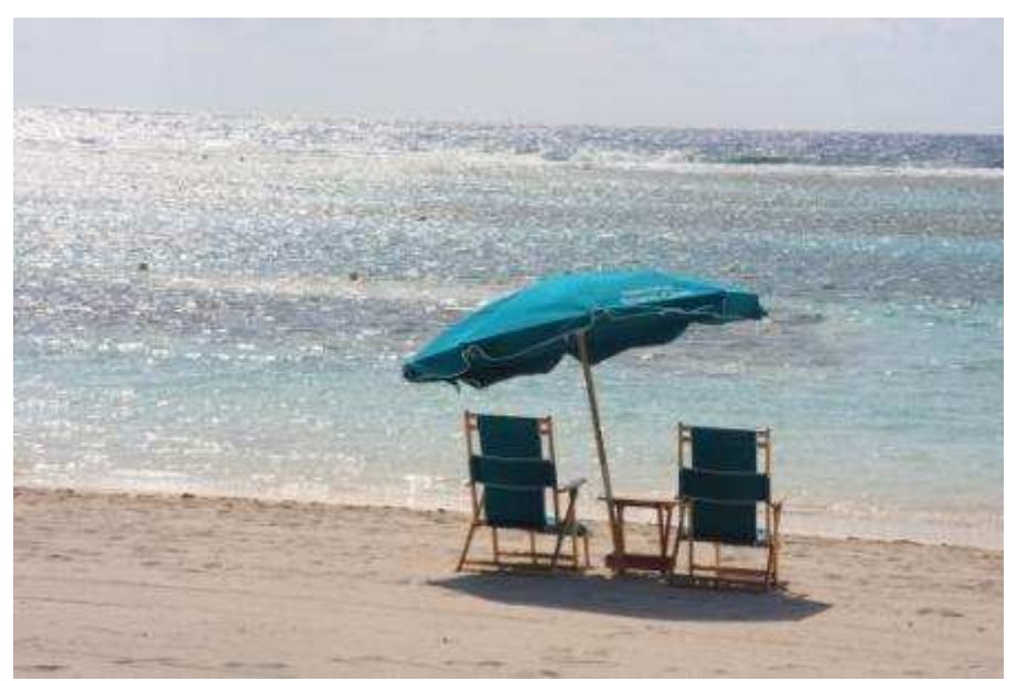
Directly out of a catalogue (Mahahual)