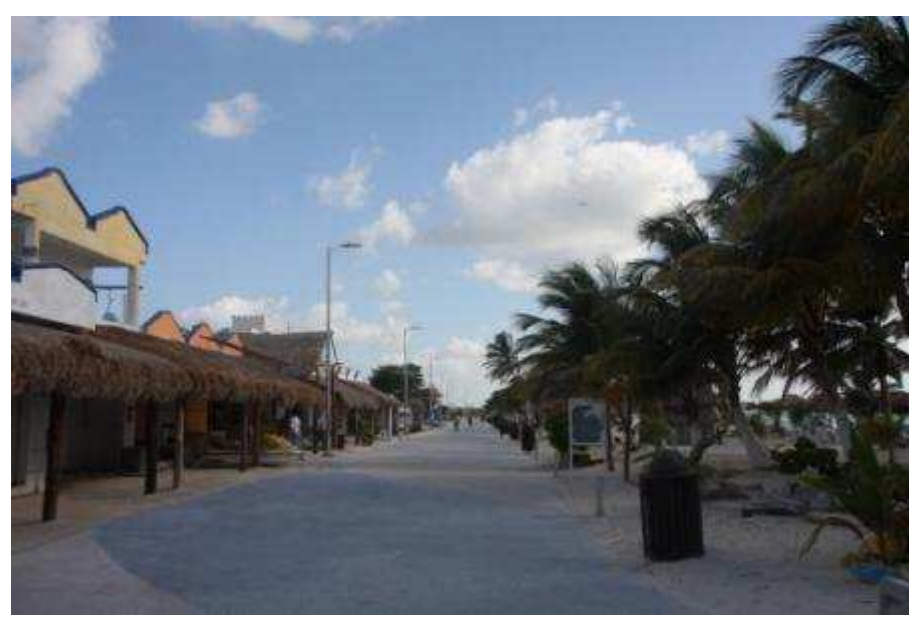
Mahahual in the early morning