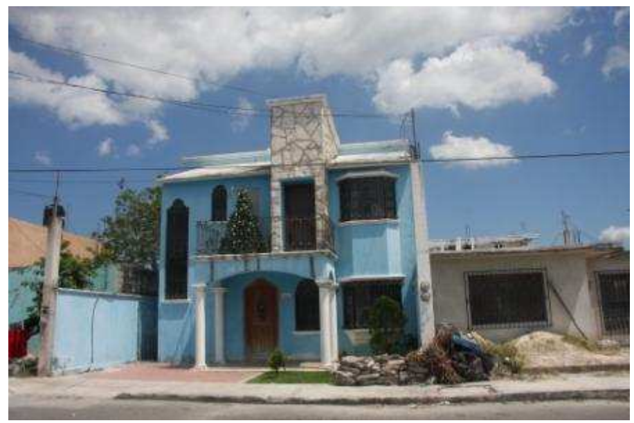
In Cozumel it's always Christmas time