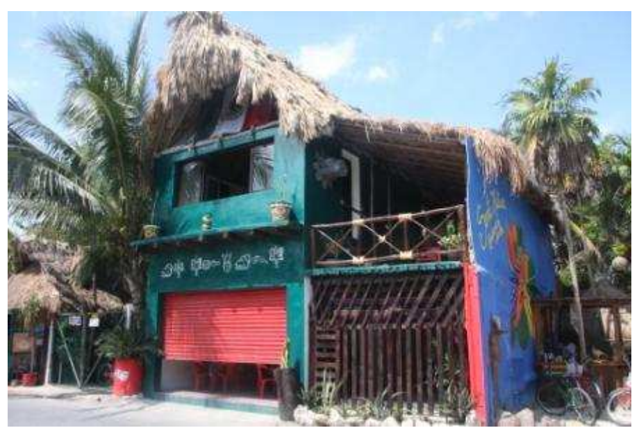
Typical impression of the area next to the beach in Tulum