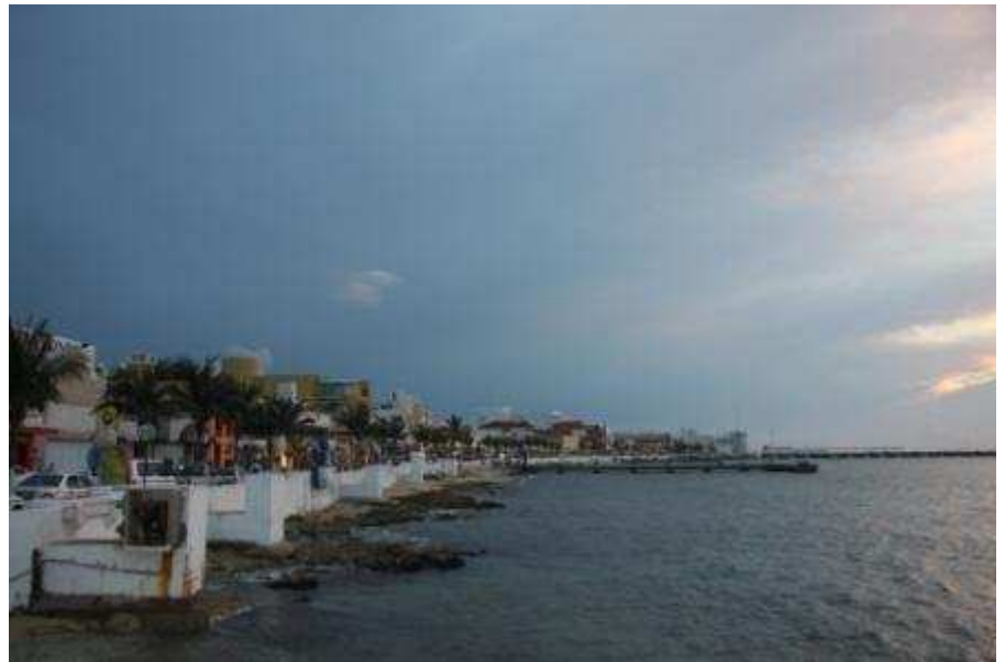
Malecón looking south from the mole where the ferry Cozumel - Playa del Carmen arrives