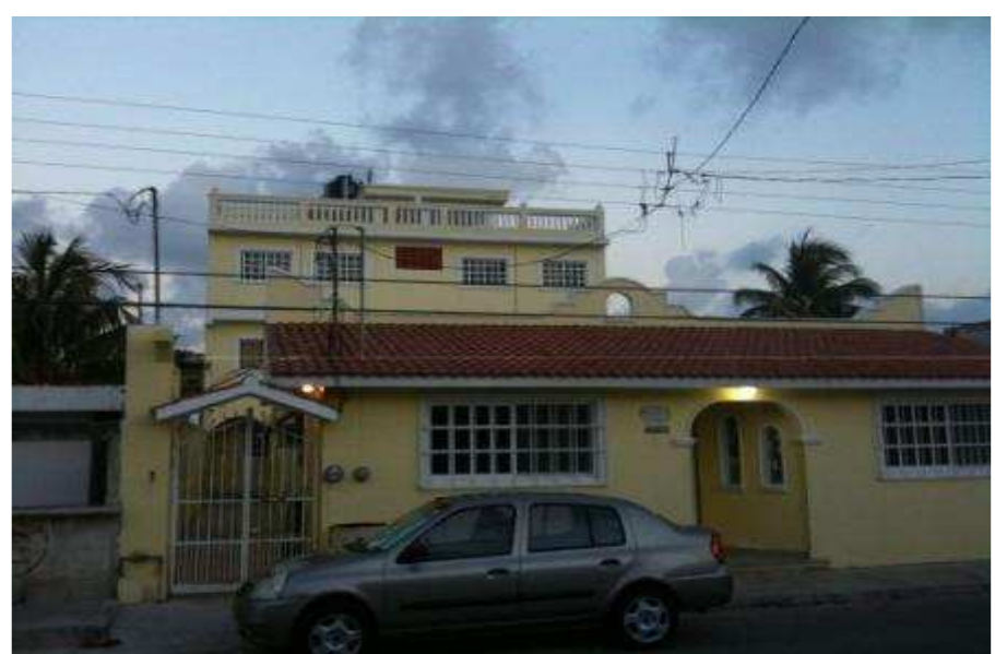
...which could be found right next to this one