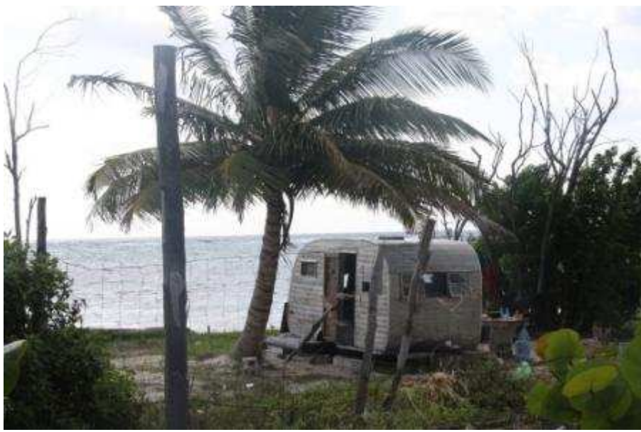
Living on Mahahual beach