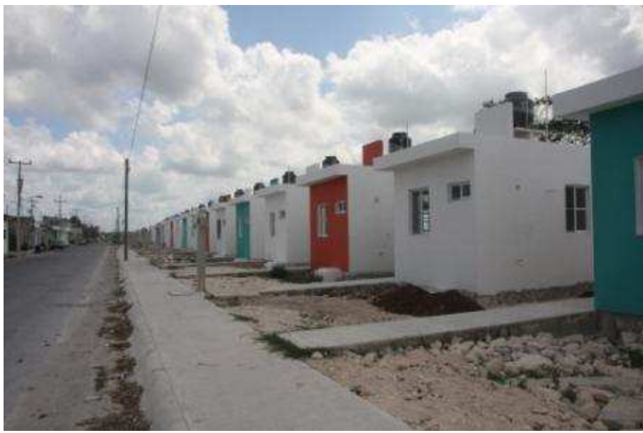
New construction at town limits, is this really necessary?