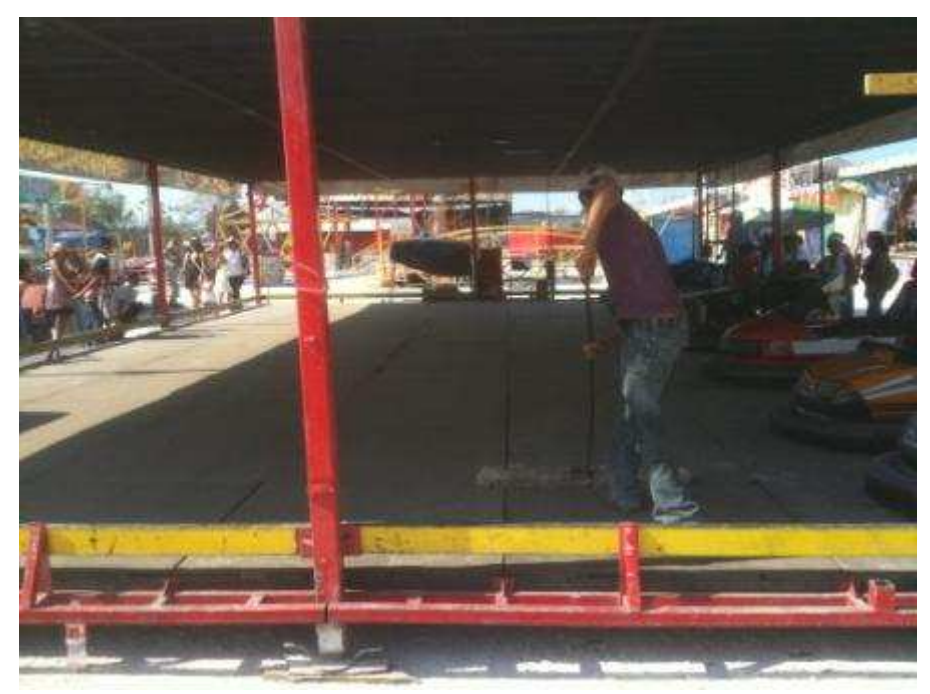
A bumber car that seems way too small for that many cars...and is cleaning necessary?