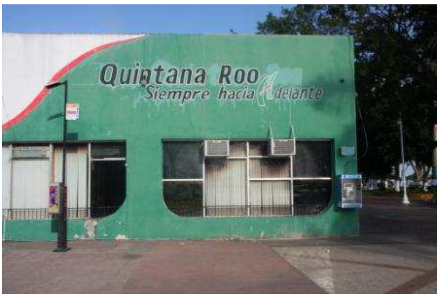
Administrative building Chetumal: "Always moving forward", but the state of the building...