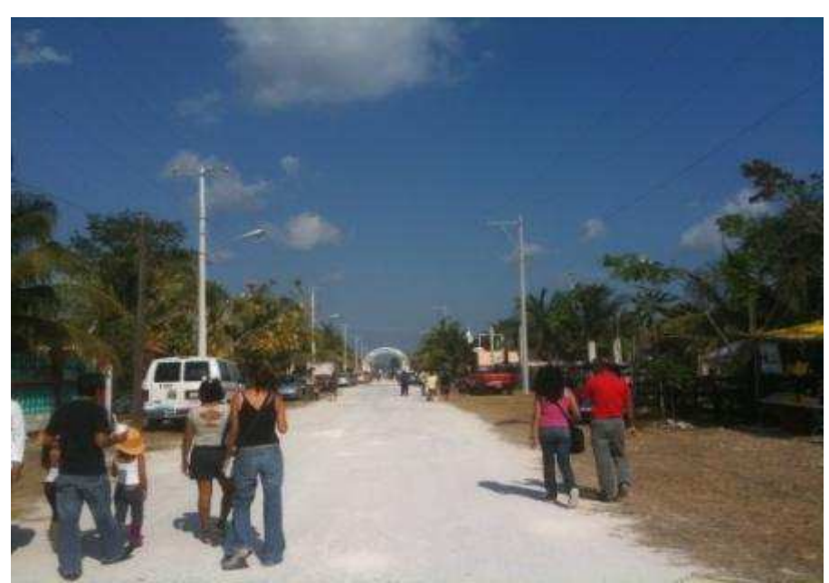
The entrance to El Cedral