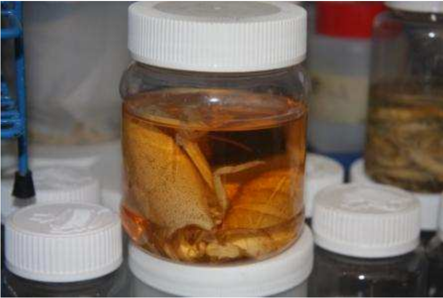
Some crabs and shrimps Luis is working with. Dead in alcohol.