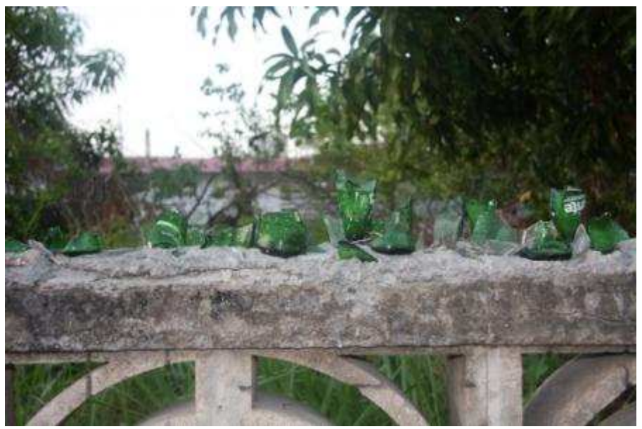
Protection against intruders (Chetumal but as well anywhere else)