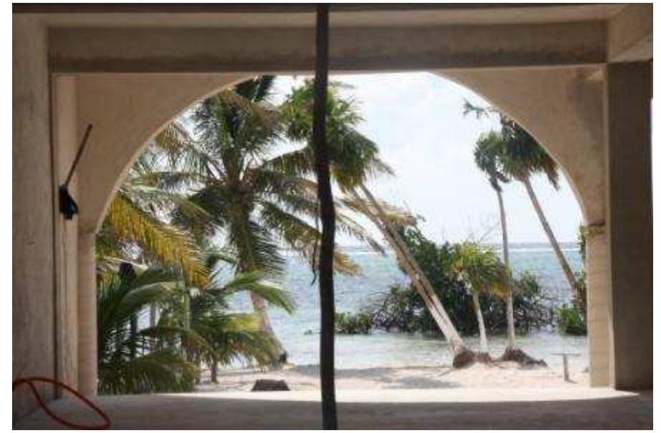
View out of the future living room (Mahahual)