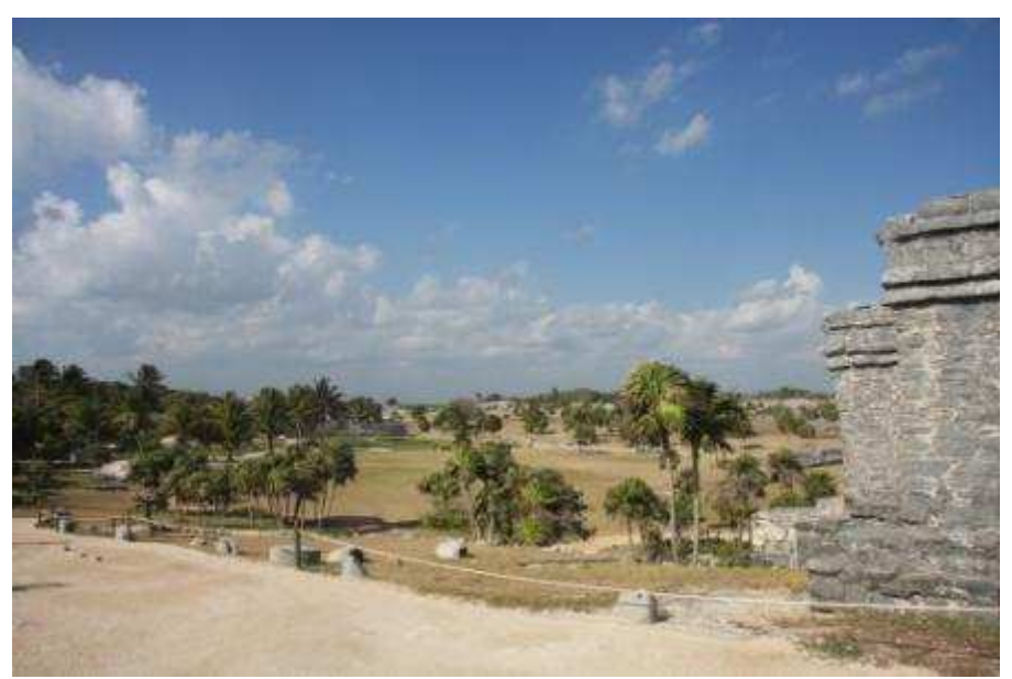
The Mayan ruins in Tulum