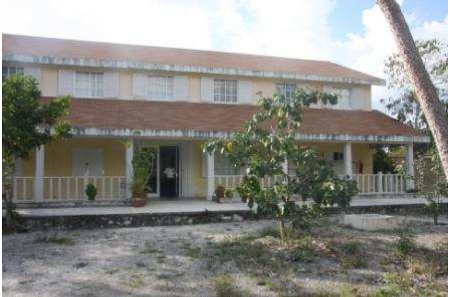
One of the teachers' buildings; the one where I share the office with Luis