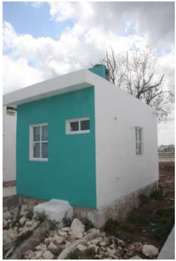
A home actually looks like this...