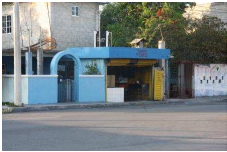
Typical Mexican snack bar for take-out food