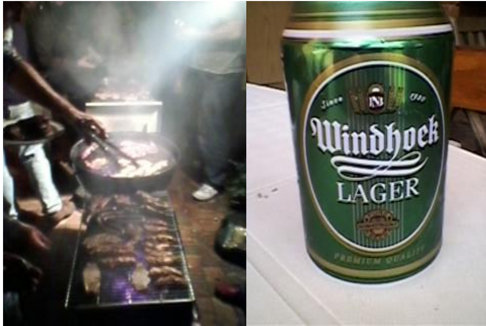
Braai and Beer

When we wanted to go back home my neighbor was totally drunk and I had to drive us home. Besides the fact, that his car only had one side mirror, I experienced how it is to have speed bumps on the streets – it totally sucks! I really do not know which idiot invented speed bumps, it totally destroys the fun and it is definitely not good for your car. But nevertheless, it is not really difficult to drive on the other side. The only problem I had for the whole two month: walking over the street is damn dangerous because I was always looking to the wrong side first.