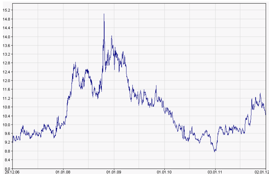
EUR-ZAR – last 5 years

How can I get South African Rand (ZAR)? Below you can see the EUR-ZAR exchange rate over the last five years. So the time I was there, one Euro was worth about ten Rand. I do not want to dive into deep discussion of the following graph or currencies in general. Let me tell you about the way how I changed my money from EUR to ZAR and the other way around.