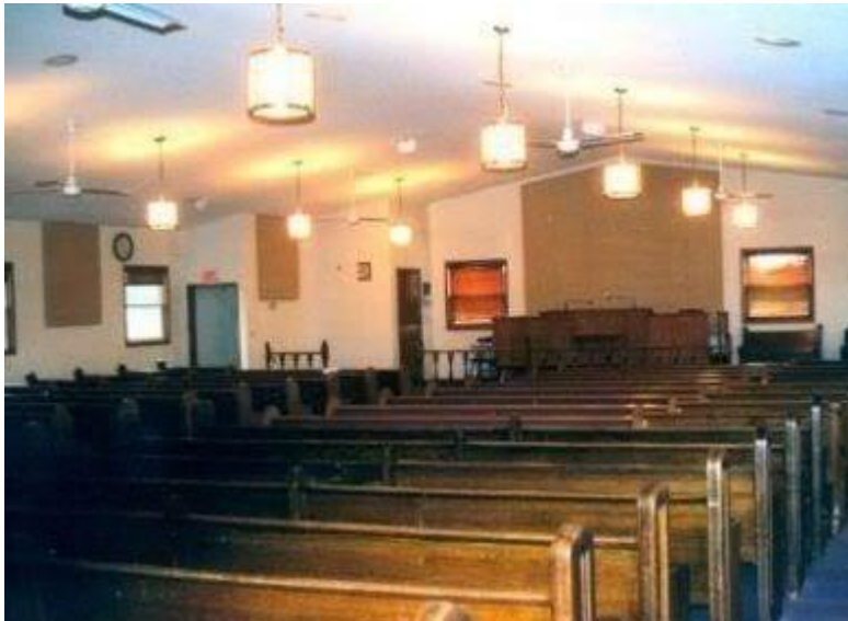
Do you like old apostolic church more than harvest? ;)

But not every church is like that. One day I went to the old apostolic church with a friend of mine. This was totally different to what I have expected. First of all they are speaking Africans most of the time whereas the Harvest church was English speaking only. But the strange thing was that it was more or less like in school. The priest was asking questions to the youth (It was a Thursday, not on a Sunday and only the youth was there). For me it looked like, that they were forced to learn the religion and everybody was sitting around hoping that he or she does not have to answer a question. They also had no flat screens in this church.