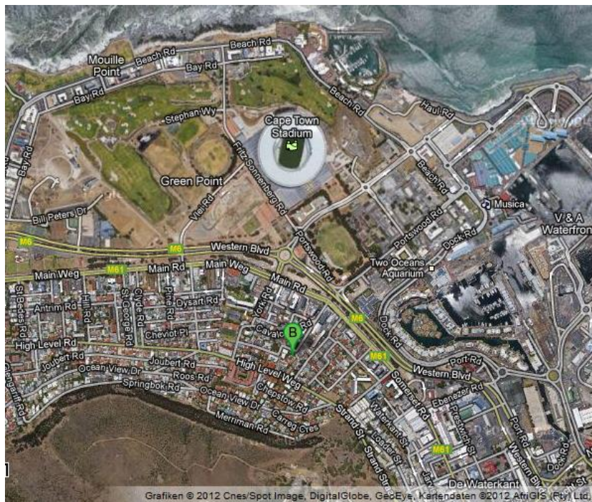
B&B and Stadium

The first night in CT I felt asleep between 1 and 2 a.m. and I had to wake up early, because we had to be at the conference at 8:30 a.m. So, the next morning I met all the computing science master students from the NMMU, we had breakfast and walked down to the conference. After the first 24 hours in South Africa I had a very good contact to most of the guys. So I was very happy, that I stayed at the same hotel, as they did. All the nights after the conference was over, we had a lot of fun, talking shit, eating, drinking and a bit partying. We could even listen to a live concert of Coldplay, because we stayed next to the soccer stadium where they played one night (that evening the city was really really crowded!!).