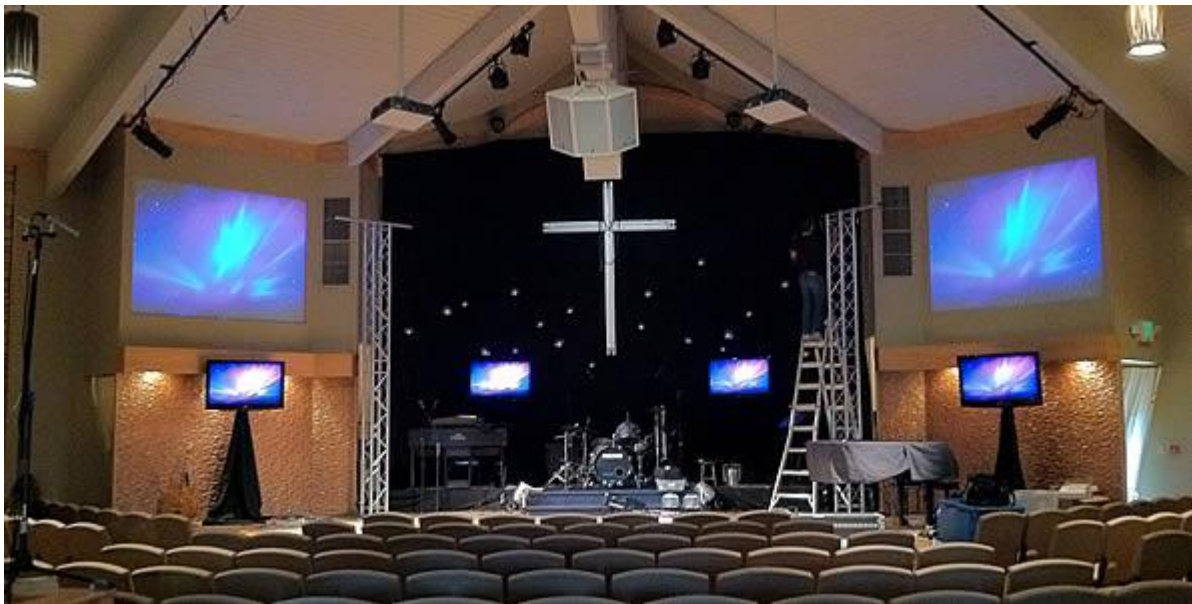
That is not the harvest church in PE, but at least very similar ;)

So, one Sunday I went to church with my landlord and his friends. The church was called Harvest Church and my first impression was great, because I saw three flat screens, a video cam, one beamer and a projector screen. All the people were dressed like they like to be dressed and most of the time they were all singing in a way which reminds me to what you see about church on American TV – that gospel stuff. The flat screens were showing the lyrics and some pictures. On the projector screen you could see the priest and everything which was happening in front. I personally had the feeling that this type of church has the target to bring all the people together. And I liked most of the things they did.